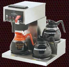
Three Warmer Low Profile Brewers