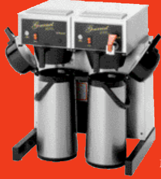
Model 8792AF (Dual Brewer)