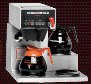
Three Warmer Electronic Brewers