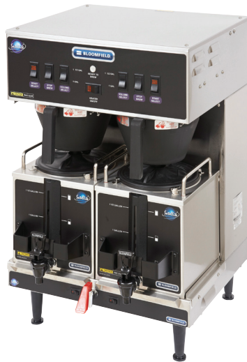
Model 9221 (Includes two (2) Satellite Dispensers)