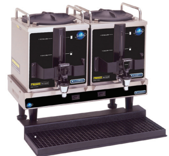
MODEL 9442 Warmer shown with optional Drip Tray (Satellite dispensers sold separately)