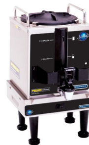
MODEL 9441 Warmer (Satellite dispenser sold separately)

*CE models have one year parts warranty only