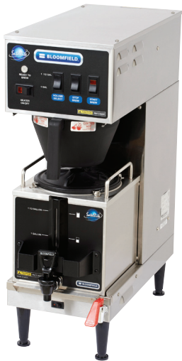
Model 9121 (Includes one (1) Satellite Dispenser) Shown with drip tray - sold separately